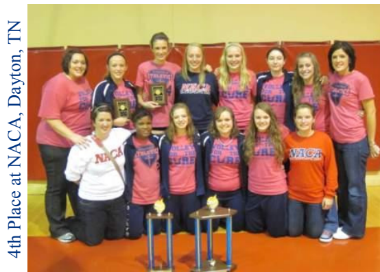
4th Place at NACA, Dayton, TN